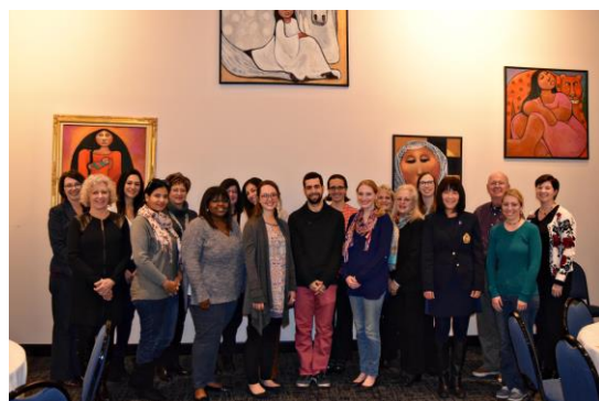
Certificate recipients at the Fall Certificate Ceremony

While the number of certificates awarded this year was higher than last year, as was the number of active participants, the number of new participants registering for the program decreased slightly.