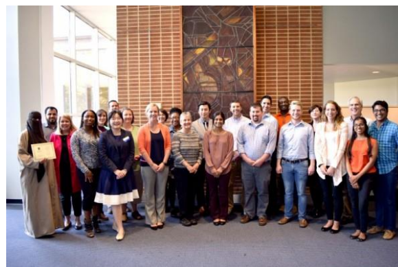
Certificate recipients at the Spring Certificate Ceremony

Names, departments, and faculty mentors for recipients of the Certificate in University Teaching Skills can be found in Appendix B . Names and departments of recipients of the Foundation Certificate can be found in Appendix C .