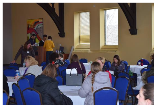
2017 Winter Institute Concurrent Session